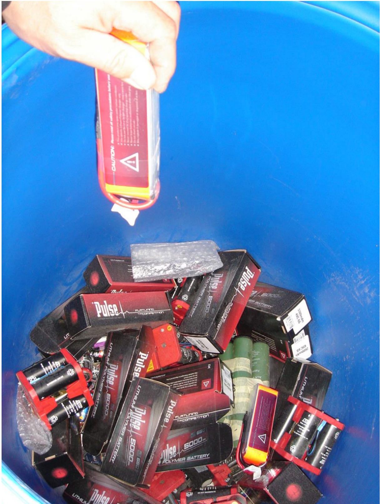
Foto 7: Immer häufiger finden sich Batteriepakete aus RC-Spielzeugen mit grossen Energiespeicherkapazitäten separiert in den Inobat Sammelfässern. Diese gelangen von Abgebern so zu den Sammelstellen oder werden in Zerlegebetrieben so entfrachtet und gesammelt.

Foto 6: Immer häufiger finden sich RC-Spielzeuge mit grossen Energiespeicherkapazitäten im Schüttgut. Interessanterweise scheinen diese Abgeber sensibilisiert zu sein, denn in den allermeisten Fällen sind die Batteriepakete bereits entfernt.