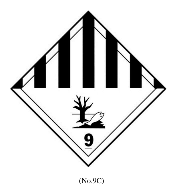
Class 9 environmentally hazardous substances Symbol (seven vertical black stripes in upper half, fish and tree in lower half): black; Background: white; Figure "9" underlined in bottom corner'