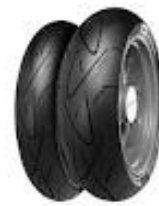
Continental Sport Attack