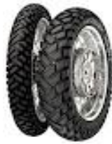
Metzeler Enduro 3