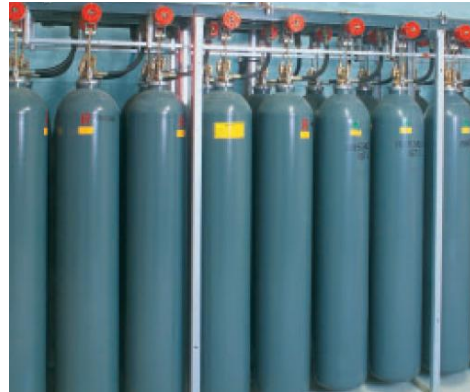
Figures 4 and 5: Gas cylinders used in stationary fire-fighting installations