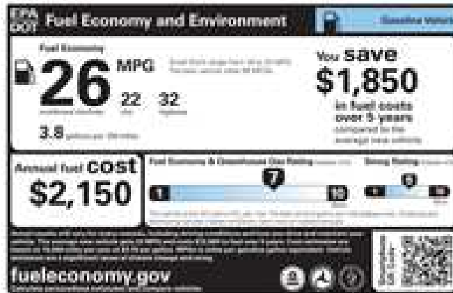
Figure 1-Gasoline Vehicle Label