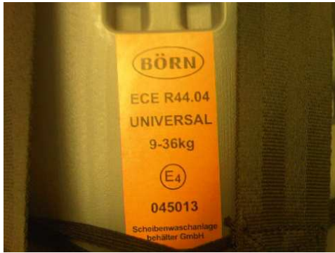
Figure 3: Details of Apramo seat genuine back and its copy