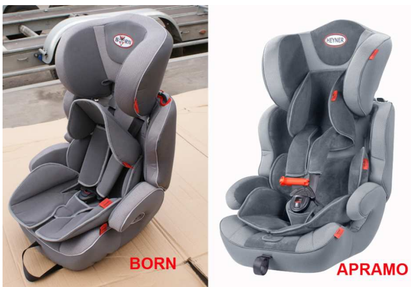
Figure 2: Apramo genuine seat and its copy

Apramo applied for a patent including headrest adjust mechanism and seat contour last year, and the application was accepted by China Patent Buro.