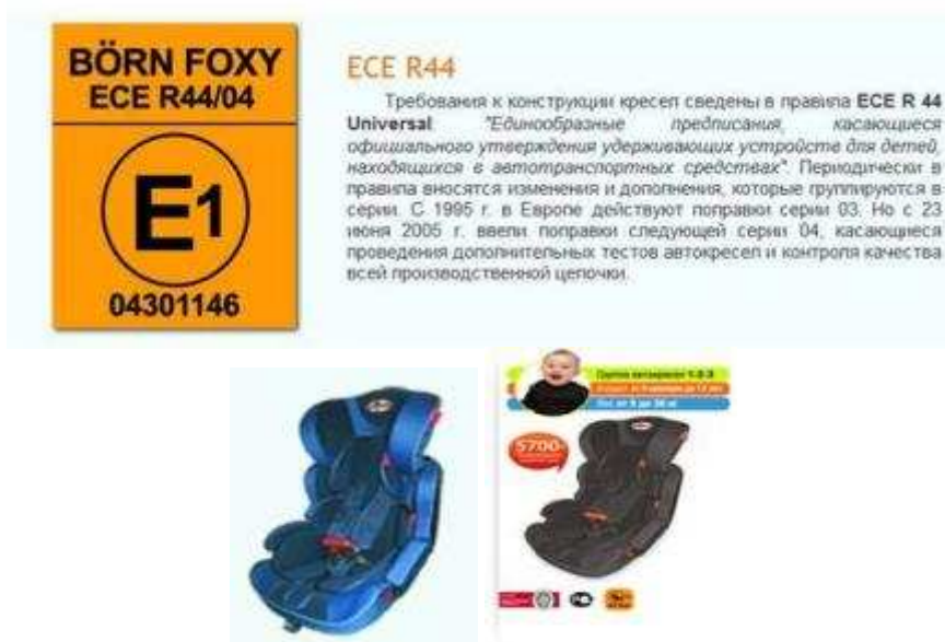
Figure 1: Foxy seat displayed in the Börn company web page

They use the Baby Safe Infant Carrier Seat approval no. E1 04301146 from Britax Römer in their web page ( http://www.born-sitz.ru/3in1.html , at to the bottom of the page), with the name of their seat Foxy on the approval ECE 44 label as shown in Figure 1. The label is false as it says that the Foxy child seat from company Börn was approved in Germany by KBA Authority (false statement) under the approval number (another false statement) which belongs to Britax Römer. Britax Römer has talked to KBA and learned that the use of the KBA logo, by Börn, was unauthorised, according to §5.2 of Regulation 44.