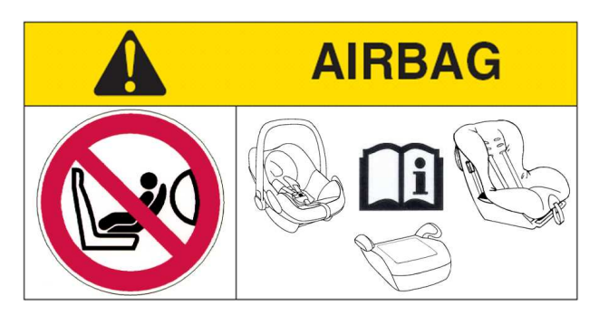
(Actual proposed size of 80 x 40 mm if printed on A4 paper)

The size of the warning label should remain at least 120 x 60 mm, as the size proposed in working document ECE/TRANS/WP.29/GRSP/2010/12 is not sufficient.