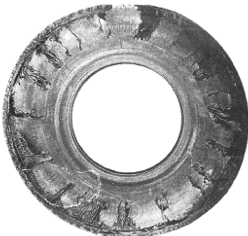
Photo 2: Ultimate tyre failure, resulting from driving on an under-inflated tyre.

To control such risks, ETRTO wishes that the second test method for TPMS approval specifies that (1) the test pressure shall not be lower than the minimum cold inflation pressure of the tyre, and (2) the TPMS shall alert in less than 20 minutes.