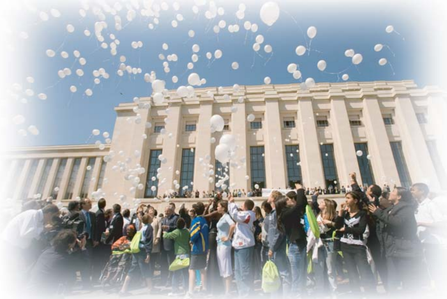
► Picture above: Balloon slip to commemorate the 1049 young people who die in road traffic crashes every day, during the First United Nations Global Road Safety Week, 23-29 April 2007, Palais des Nations, Geneva

Road safety is a development issue, as it disproportionately affects the poor in low and middle-income countries. Road