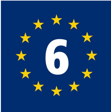
Standard version with stars