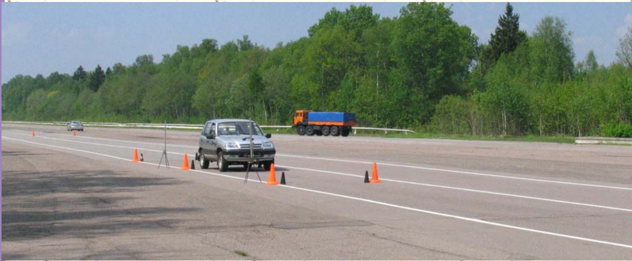
Test Track Marked Corridor