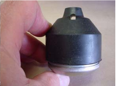
Figure 2(b) Individual perforator