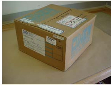
Figure 1(a) Outer packaging

5. The charges are shown in detail in Figure 2. They measured 53.8 mm in diameter and 61.3 mm in length. The total mass of a single article was 265 g. The outer casing was in metal with a rubber sleeve. The article contained a 1 g RDX booster charge plus an 18 g RDX base charge to