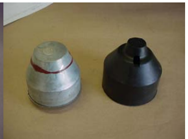
Figure 2(d) Rubber cover removed