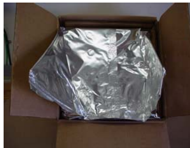
Figure 1(c) Intermediate packaging