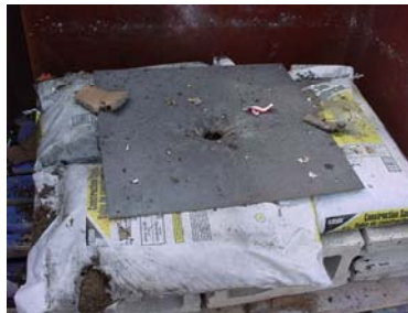
Figure 3(b) Witness plate from Trial 2