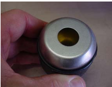
Figure 2(c) Perforator end cap