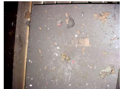
Figure 3(b) Witness plate from Trial 3