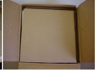
Figure 1(b) Intermediate packaging