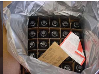
Figure 1(d) Inner packaging