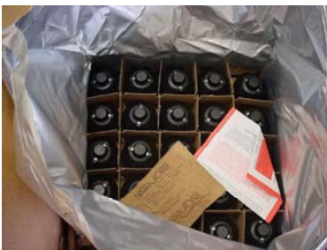
Figure 2(a) Perforators as packaged