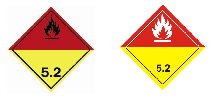
"(No. 5.2) Symbol (flame): black or white; Background: upper half red; lower half yellow; Figure "5.2" in bottom corner".

Replace label No. 5.2 and the text under the label with the following: