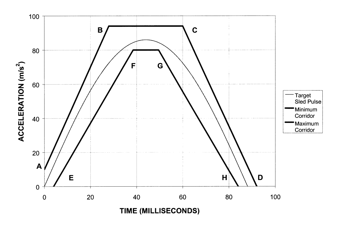
A 165 mm dia. sphere Section A-A

Figure 1 of §571.202a - Sled pulse acceleration corridor. The target acceleration with time expressed in milliseconds is a = 86 \sin(\pi t/88) \text{ m/s}^2 , for V = 17.3 \pm 0.6 km/h. The time zero for the test is defined by the point when the sled acceleration achieves 2.5 m/s<sup>2</sup> (0.25 G's).