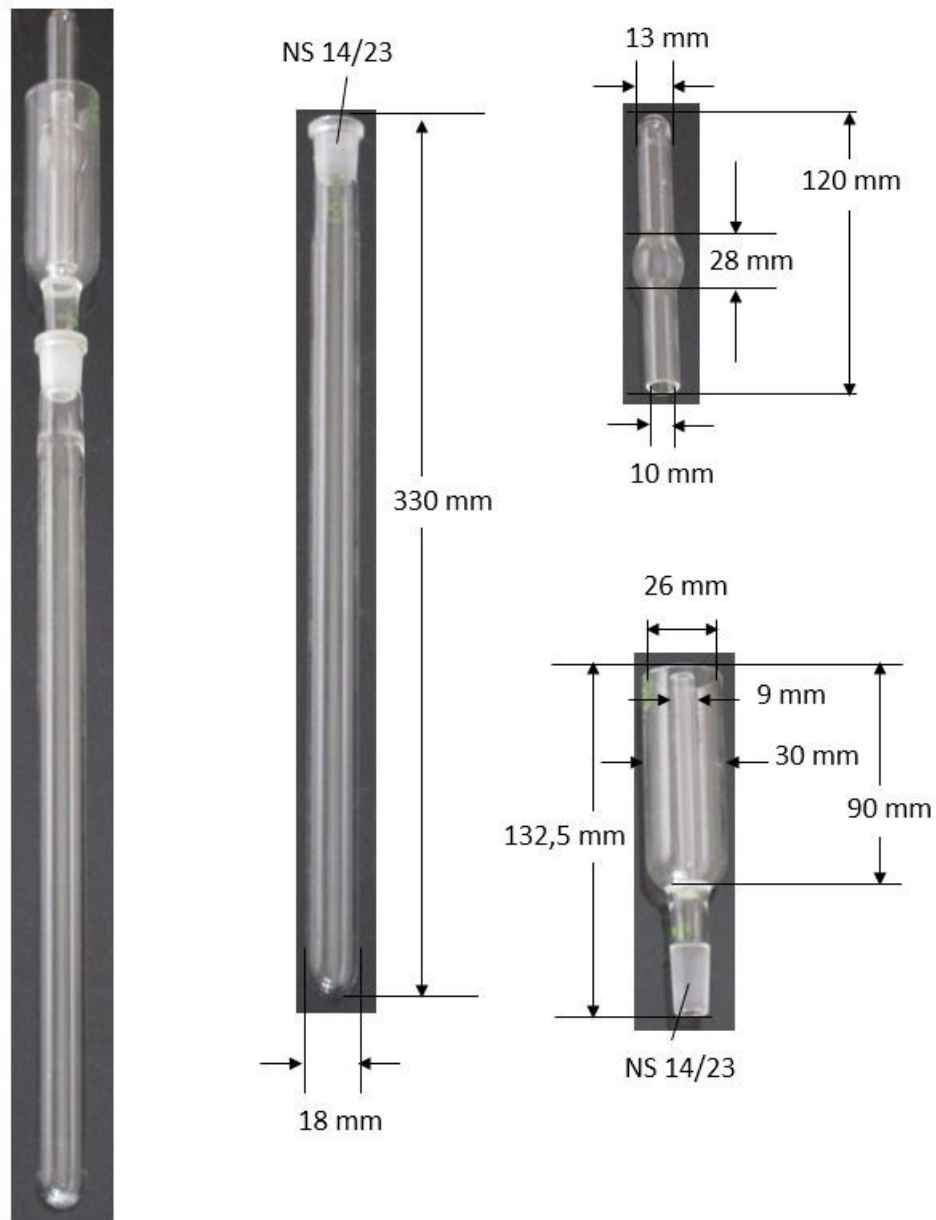
Figure A10.1: Condensing chamber for Bergmann Junk test example 1