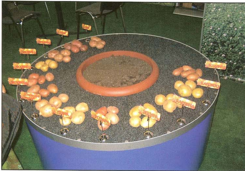
An exhibit of seed potatoes by variety, most of them protected.

a direct influence on US exports or export potential.