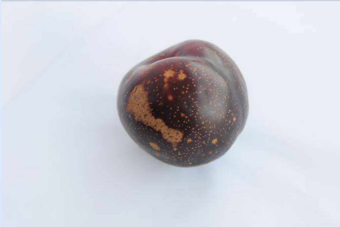
6. Skin defects - limit of Class II.