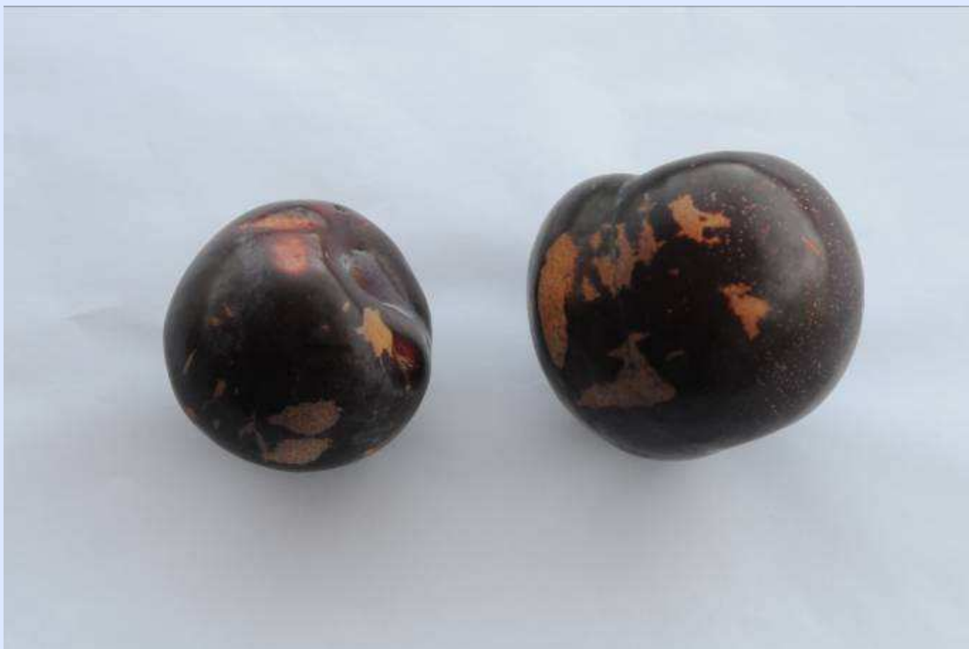
7. Skin defects - limit of Class II.