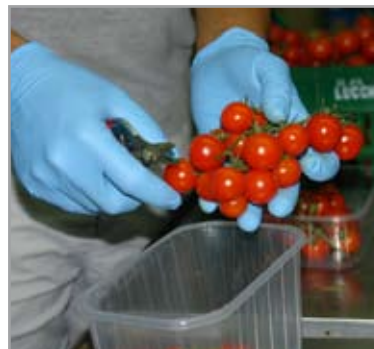
Grading cherry tomatoes at the packhouse of the “Pomodoro I.G.P. di Pachino” cooperative

Zucchini, Peperoni, Pomodoro, Pesche e nettarine. The programme of the latest UNECE Workshop reads like the menu of your favourite Italian restaurant. The three-day workshop on international commercial quality standards for agricultural produce, held in Ispica, Sicily on 24-26 September, focused on Sicily’s major export products – table grapes, peaches and nectarines, tomatoes, sweet peppers and squash (zucchini/courgettes). Organized jointly with the Sicilian Regional Ministry of Agriculture, and Trade Point Ragusa, the workshop aimed to promote UNECE and European Commission standards relating to those agricultural products that have high export potential for that region, and also to show local growers and traders how the standards are interpreted in the countries that import Sicilian produce.