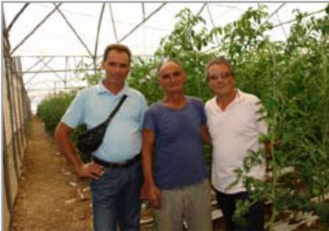
Growers of cherry tomatoes in a greenhouse outside Ispica

Exported products are often rejected for reasons unrelated to their intrinsic quality, such as marking, sizing, careless picking and handling, minor skin defects that result in rotting during long-distance transportation. Almost no additional investment is needed for