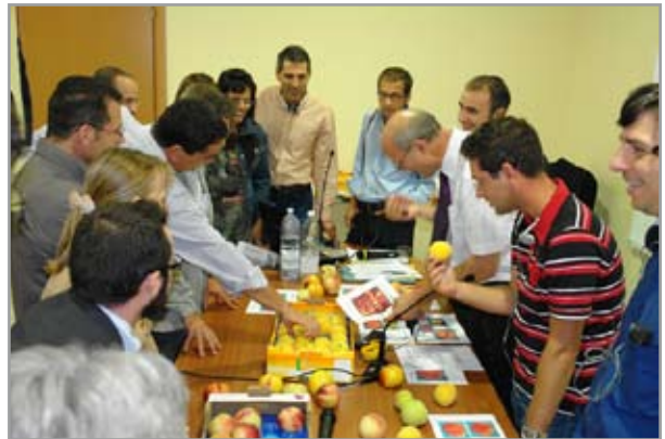
Discussing the commercial quality of peaches

Sicilian fruit producers who benefit from growing conditions that allow them to deliver fruit that is ripe and tasty – in addition to meeting the standard requirements of careful picking, transport, labelling and presentation – may well succeed in influencing consumers in export markets to select their produce in preference to other producers' goods and thereby increase both sales and profit.