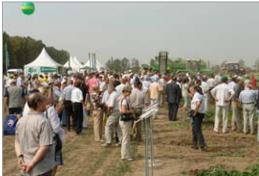
Demonstration fields at Korenevo