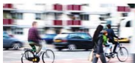
Health economic assessment tools (HEAT) for walking and for cycling

Partnership on Cycling Promotion (PCP) aims to strengthen and extend the existing network of cycling officers; to develop a pan-European Master Plan for Cycling Promotion; to share good practices; and to develop guidelines and tools. The Master Plan for Cycling Promotion will be launched at the Fifth High-level Meeting on Transport, Health and Environment in Austria in 2019. Coordinating partners: Austria and France.