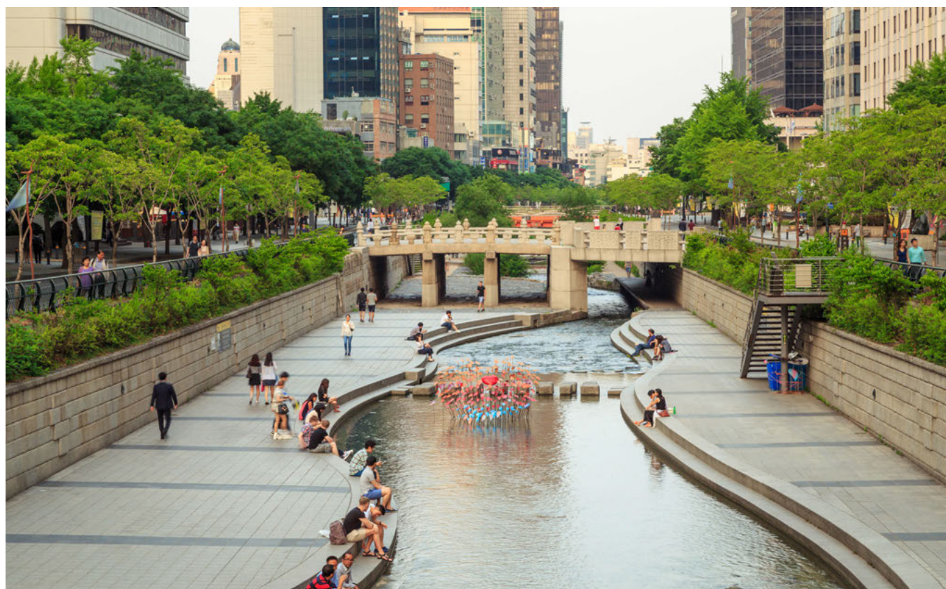
Seoul, South Korea - June 14, 2015: Cheonggyecheon is a 10.9 km long, modern public recreation space in downtown Seoul, South Korea.

The event will offer an avenue for participants and stakeholders to discuss how to shape the 21st century urbanization model in a climate-friendly way, based on preliminary findings from the One UN System input into the Habitat III process on cities, climate change and disaster risk management and smart sustainable cities, and other multi-stakeholder and partner initiatives.