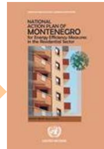
National Action Plan