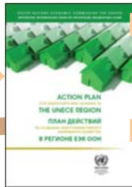
UNECE Action Plan