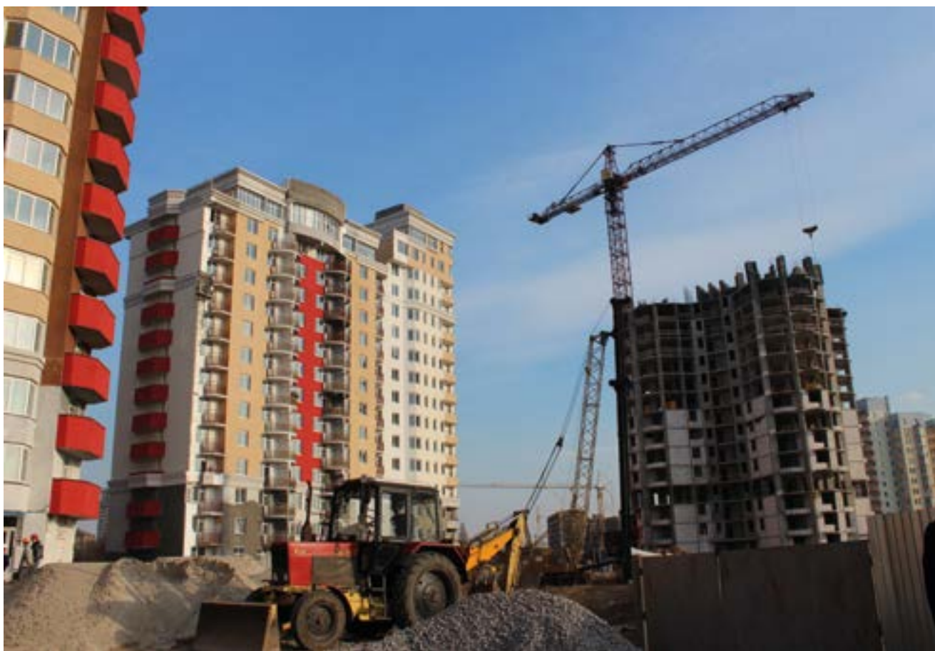
Picture 9. A social housing under construction

The Government is working to introduce detailed regulations through zoning or binding regulation plans. Additional procedures should be considered to allow flexibility in interpreting the zoning plans (given their technical nature) and in evaluating development projects. Another tool that could help to simplify regulation as well as make it more effective is a set of national building codes. For example, a national building code on energy efficiency or design requirements for new buildings is important when local authorities have limited capacity to deal with the issues. Less prescriptive guidance is another tool and used for coordination matters, e.g., the coordination of transport and land use through control of accessibility.