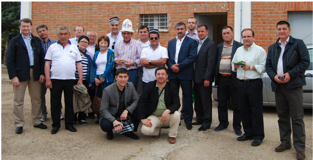
Participants of the study tour

The experiences of Portugal and Spain will be further examined by experts from the countries of Central Asia. Water professionals from Spain and Portugal are expected to attend the meeting of water management organizations in August 2013 in Dushanbe.