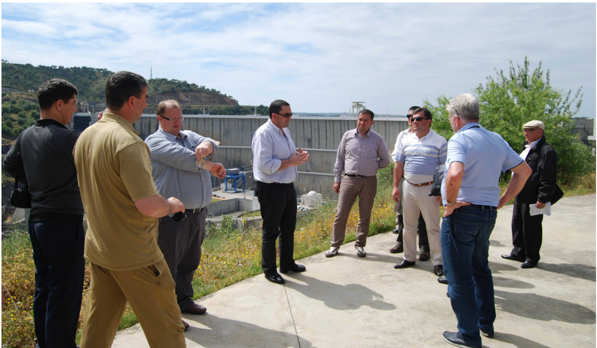
Many water management installations were visited during the study tour

During the visit special attention was paid to issues related to the management of transboundary river basins, with the cases of Guadiana and Tagus river basins shared by Portugal and Spain. Having a similar climate to the Central Asian region (frequent droughts and floods), these two neighbouring European countries have established a mechanism for resolving inter-state disputes on water resources and emergency response by creating a legal framework for transboundary water resources.