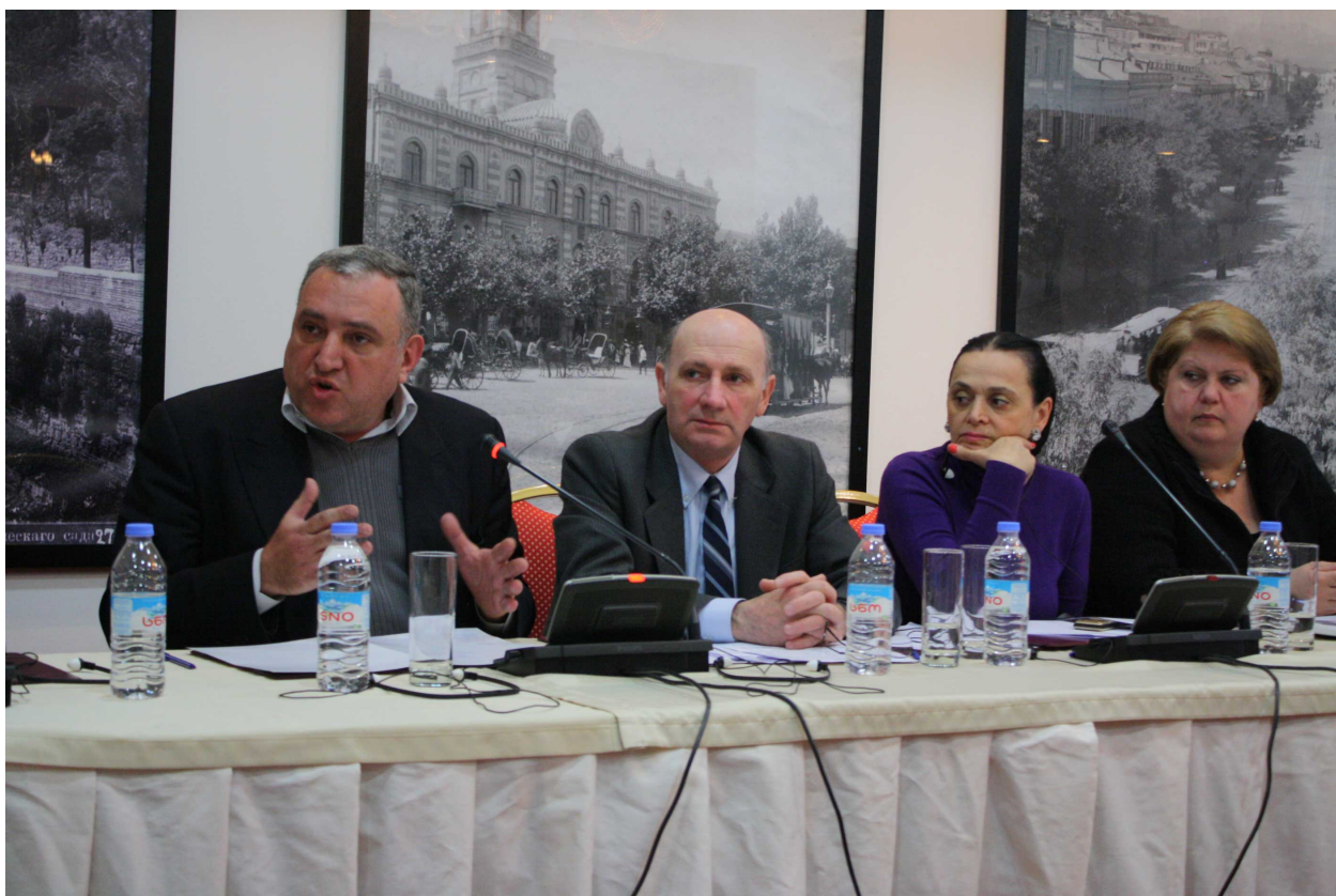
Participants at the joint seminar in Tbilisi, 7 March 2013

On 7 March 2013 a joint event was organised by two teams currently implementing EU-financed projects in water sector. During the first half of the day, National Water Partnership of Georgia held a meeting of the expert group that drafted the new Water Law. In the afternoon, the project "Environmental Protection of International River Basins" had its steering committee meeting. As there was an overlap of participants, all participants stayed for the full day, creating the possibility for an exchange of views and to find ways for future cooperation between the projects.