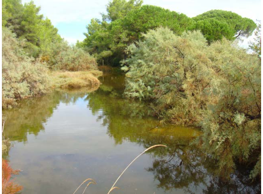
Forest in the National Park "Divjake-Karavasta"

The accessible forest stands have been significantly degraded through overharvesting and overgrazing, which has changed the forest age structure and species composition and reduced the forest underwood. For several years now, tree felling has exceeded the net annual increment, resulting in a decrease in the growing stock, and forest fires, often human induced, still pose a threat to the forest ecosystems.