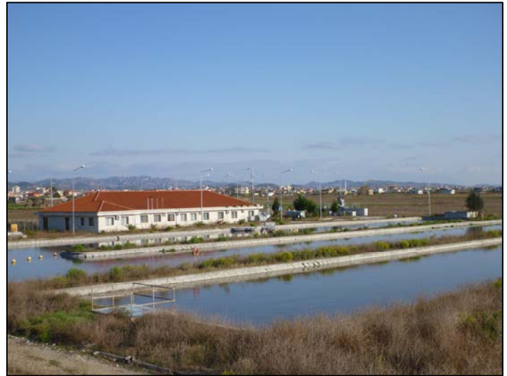
Wastewater Treatment Plant in Kavaja

At present there is only one operational treatment facility for wastewater in the municipalities of Kavaja and Pogradec. Wastewater treatment plants in the cities of Lezha, Vlora and Korca are under construction.