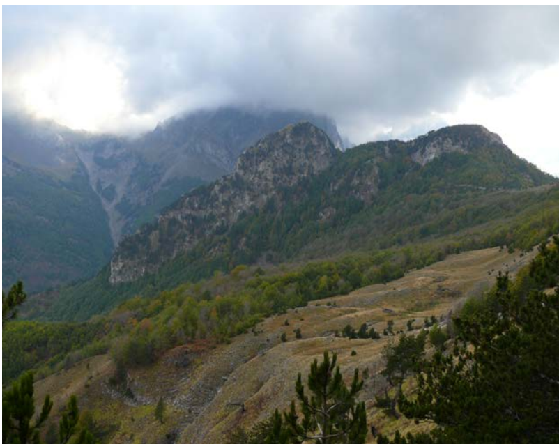
Theth National Park

Throughout recent years Albania has achieved progress in the protection of its unique natural and landscape assets. Since 1996, the surface area legally declared as protected areas in Albania has more than tripled, bringing the total proportion of protected areas in the country to 13.17 per cent of its national territory in 2011, as compared with only 5.7 per cent in 2002.