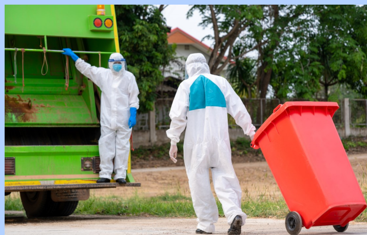
Figure 5. Off-site transport of waste

Information should be provided to the waste service provider on safe working procedures on-site and any temporary hazards associated with the collection and handling of the waste concerned. Emergency response information (e.g. European Chemical Industry Council’s ERICards) and hazardous waste tracking documents, as required by national law, should accompany each movement of hazardous waste. National legislation may require that such documents be retained for a certain period. The applicable hazard class or division under the United Nations Model Regulations (3) is identified for selected wastes in Table 1.