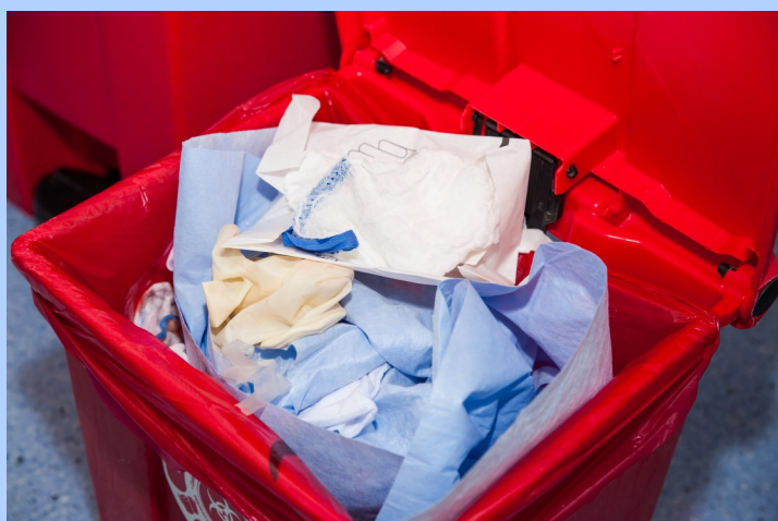
Figure 2. Standard wheeled container with colour-coded bag and biohazard label