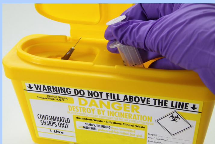
Figure 1. Sharp containers

The storage place should be an enclosed area and separated from other waste storage areas. To ensure the safe storage of chemical wastes, the following separate storage zones should be available to prevent dangerous chemical reactions: explosive waste, corrosive acid waste, corrosive alkali waste, toxic waste, flammable waste, oxidative waste, halogenated solvents, and non-halogenated solvents (4) . Liquid and solid waste should be stored separately. Cytotoxic waste should be stored separately in a designated secure location. Mercury waste should be kept segregated from other types of waste. The storage areas should be labelled according to their hazard class. Pharmaceutical waste with non-hazardous characteristics can be stored in a non-hazardous storage area. The storage area itself should have