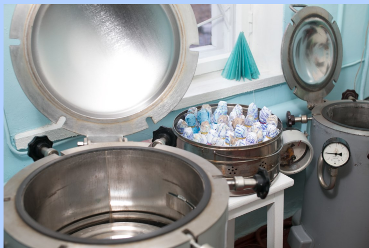
Figure 6. Autoclave

determine beforehand the time and temperature parameters needed to allow full penetration of heat to the centre of the body; disinfection of human anatomical waste is also limited due to ethical concerns. Treated waste from an autoclave retains its physical appearance. If desired, a mechanical process such as a shredder or grinder can be used after treatment to make the waste unrecognizable.