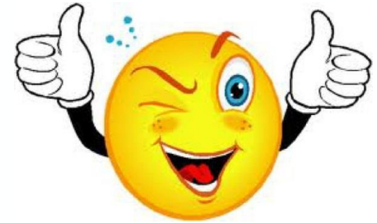
The people who like your Page